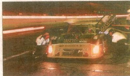
In the middle of the night, the Aim pit crew makes quick work of a tire change and fuel fill-up.