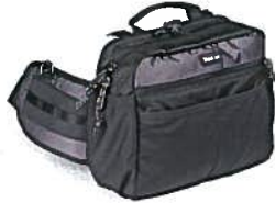
Change Up courtesy of ThinkTank.

The winner this issue, for coming up with the most clever caption, will receive one Change Up gear bag from the guys over at Think Tank. Please visit their web site at www.thinktankphoto.com for more information on this prize.